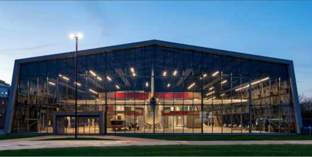
RAF Museum Hendon