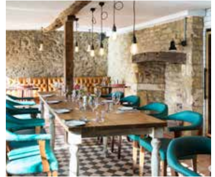
Old Stocks Inn