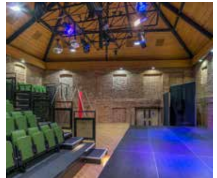
Sam Newsom Centre, Boston College