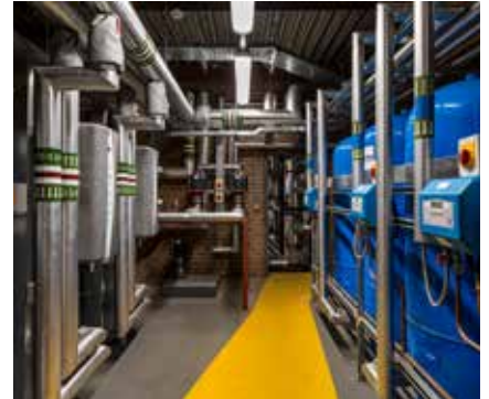
University of Worcester